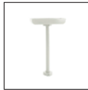
Suspension kit SBLE-SK25