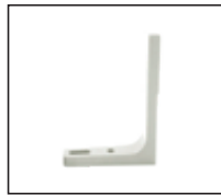
Flag kit SBLE-FK