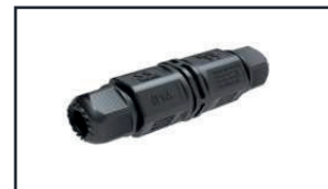
(4)IP65 Waterproof Connector