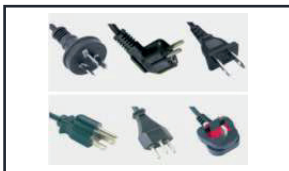
(5)1.5m SAA/VDE/UL Rubber wire+ Plug (AU,EU,US,PSE,SW,UK)