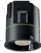
Wall Washer Module